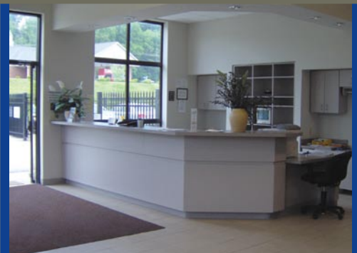
10686 LOVELAND MADEIRA RD, LOVELAND, OH