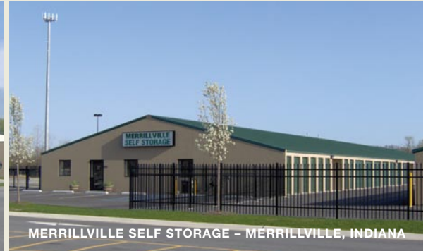
MERRILLVILLE SELF STORAGE - MERRILLVILLE, INDIANA