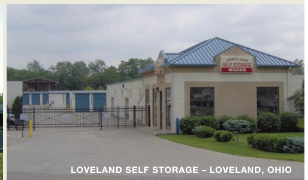
LOVELAND SELF STORAGE - LOVELAND, OHIO