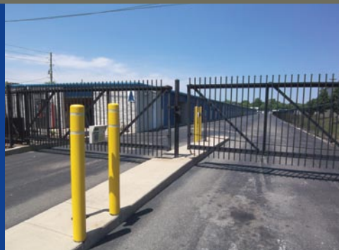
1102 EAST 52ND ST, INDIANAPOLIS, IN