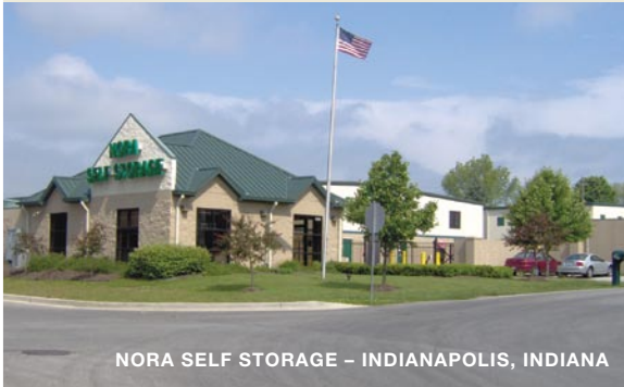
NORA SELF STORAGE - INDIANAPOLIS, INDIANA