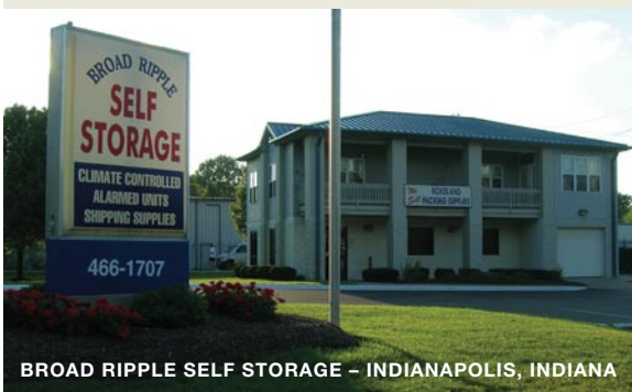
BROAD RIPPLE SELF STORAGE - INDIANAPOLIS, INDIANA