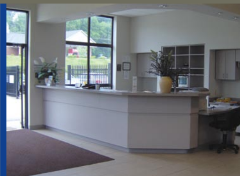
10686 LOVELAND MADEIRA RD, LOVELAND, OH